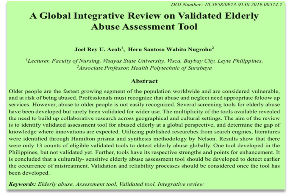
Figure 2. The literature review article (example)<sup>(2)</sup>

Ideally, this document should be accomplished prior to making a full blown research endeavor. With this manuscript, the researchers are guided in terms of the gap of knowledge which drives in the fulfillment of such investigation. In the review, the researcher must be guided with the prisma since literature studies demands a scholastic process of categorizing salient data. In the illustration below, the researcher revealed the process of developing reviews.<sup>2)</sup>